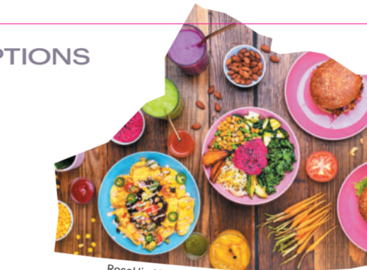
„RoseHip Vegan Bistro“

radharane.lt/vilnius f Radharane @ radharane